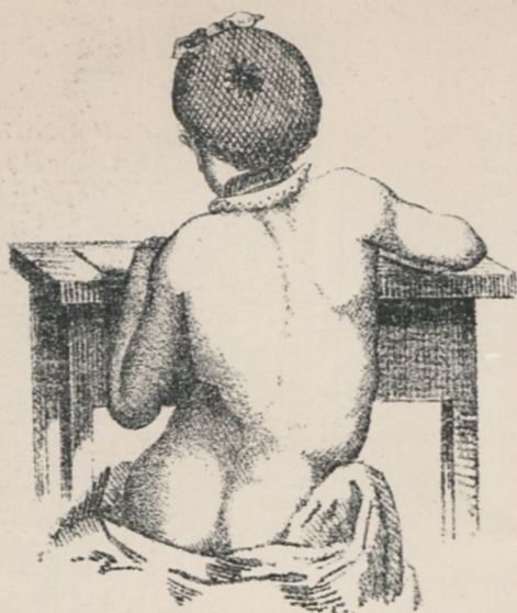
BAD POSITION CAUSED BY SITTING AT TOO HIGH A TABLE